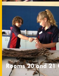
Rooms 20 and 21 Canoe making