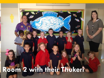
Room 2 with their Thukeri