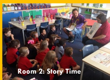
Room 2: Story Time

Students listened to the story and had discussions related to our learner qualities and values. Great discussions took place in classes and students took the opportunity to ask many questions.