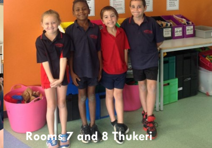
Rooms 7 and 8 Thukeri