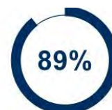
Year to Date (2021)

We understand that sometimes students are absent due to illness, family or other reasons. If your child is absent from school for any particular reason please notify the class teacher via the class App, communication book/diary or contact us on 85821077.