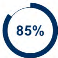
Year to Date (2022)

The average daily attendance rate; Year-to-Date, derived from student attendance data sourced from the school systems as at 02/06/2022.