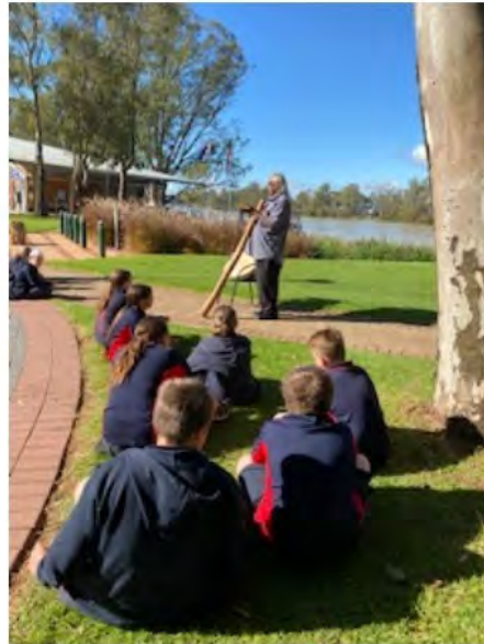
Some students listened to Uncle Barney tell stories.