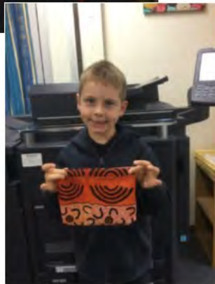
We have been making pencil cases in the library.