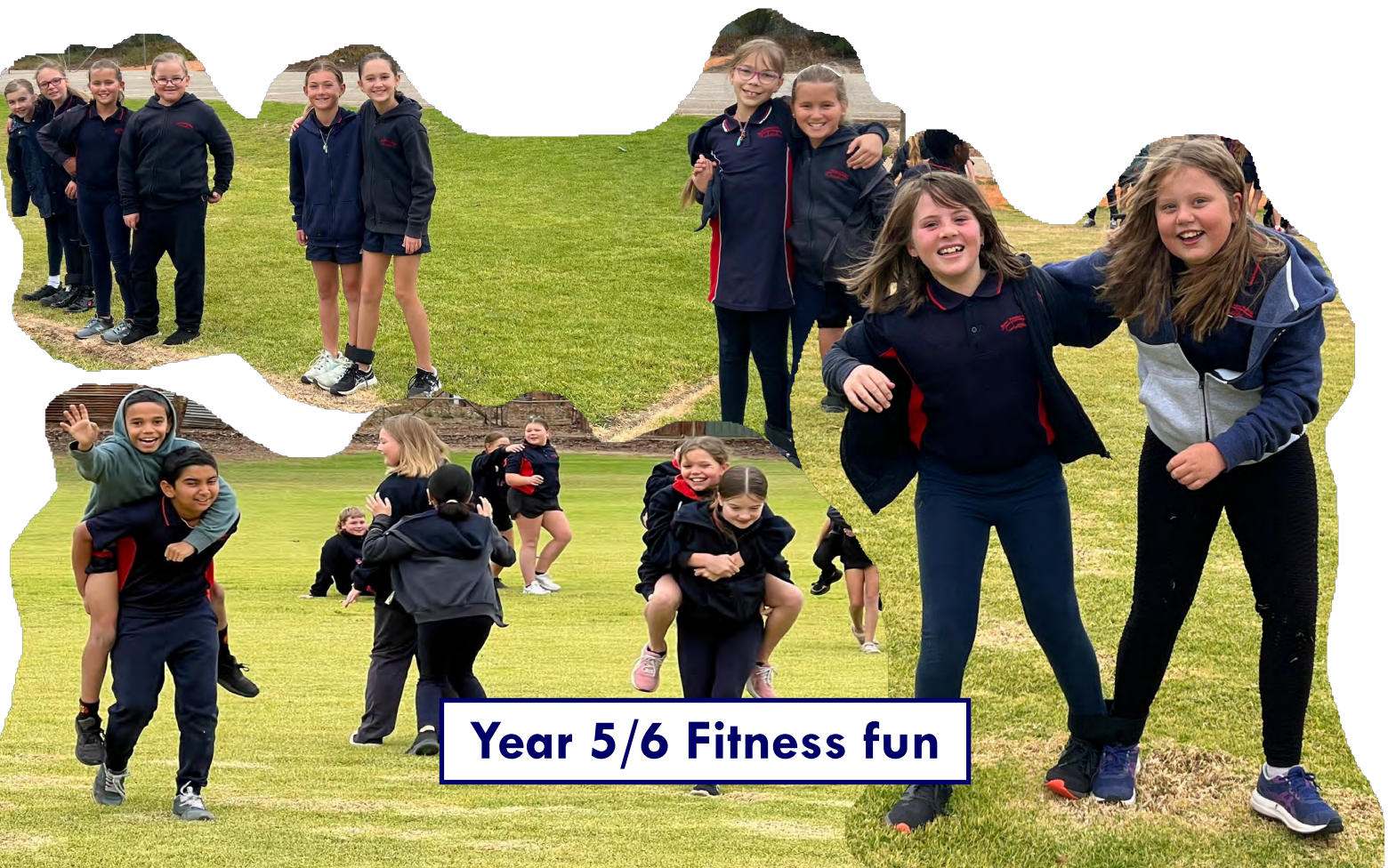
Year 5/6 Fitness fun