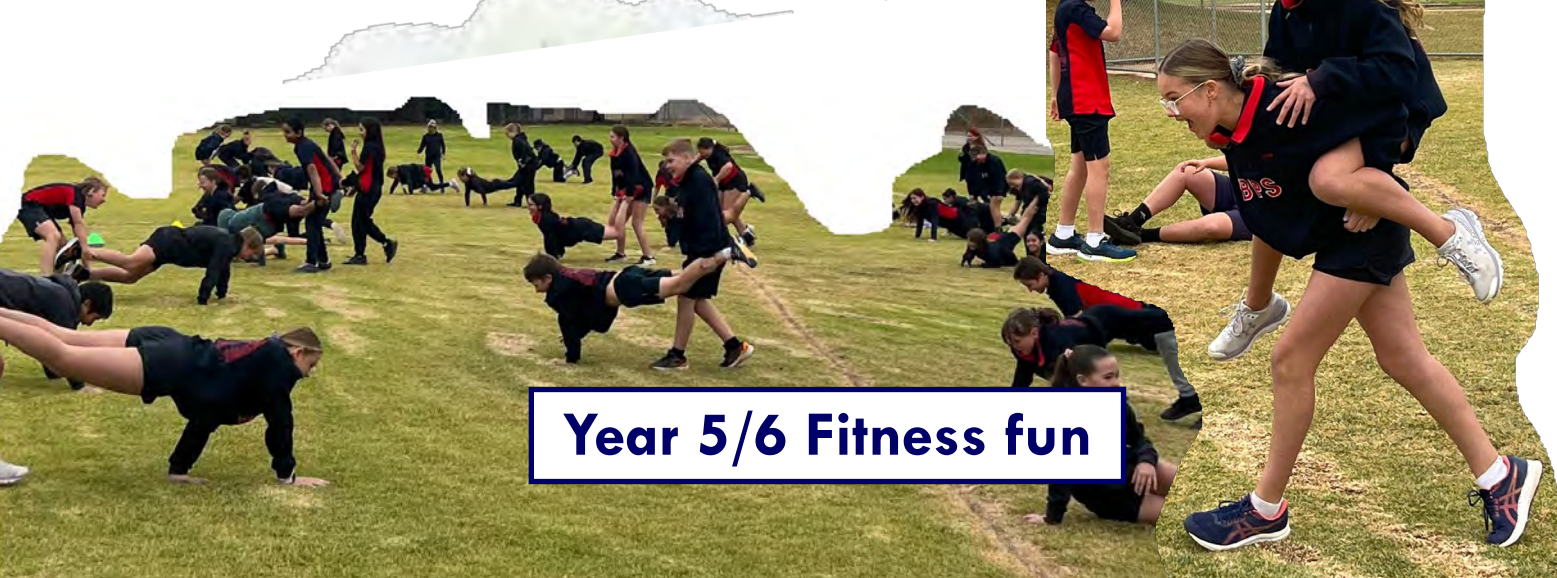
Year 5/6 Fitness fun